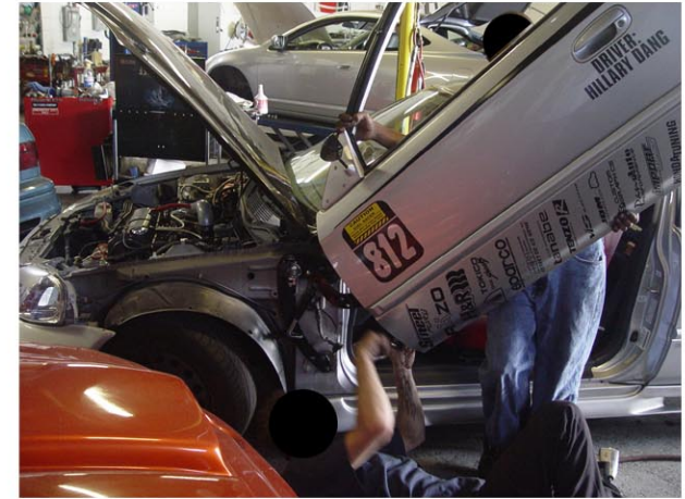
6. Install the hinge and door.