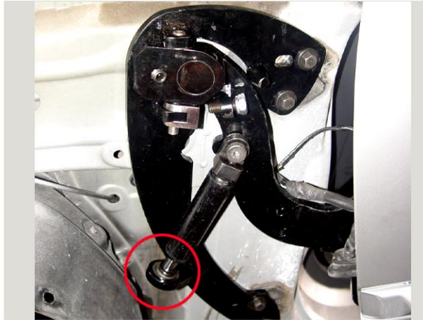
5. When installing the gas shock, insert the pin in the bottom part first.