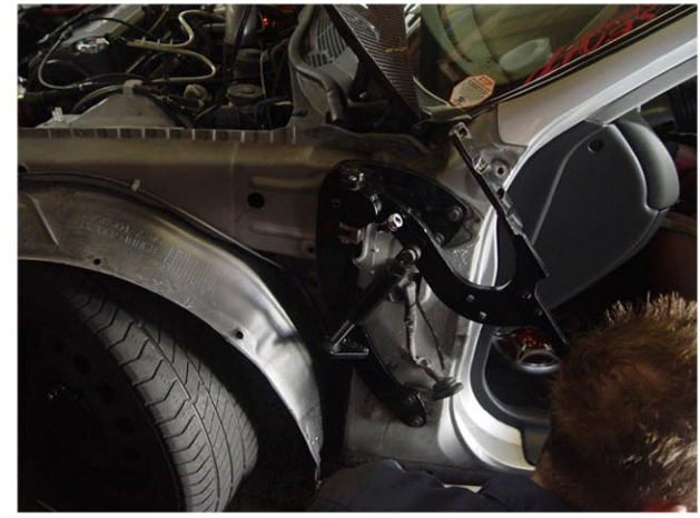
3. With the door still closed, put the main hinge up against the door as shown in the image.