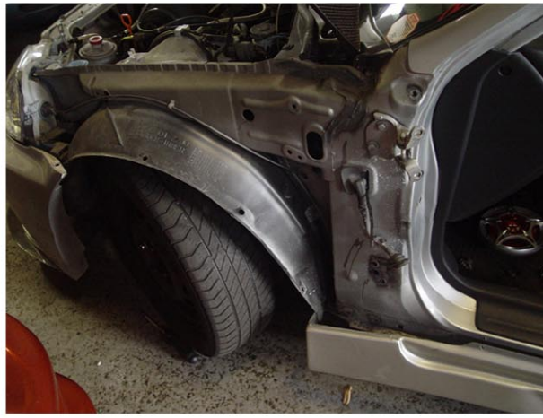
2. With the door closed, take off OEM hinges.