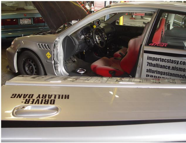
1. Take off fender and door.