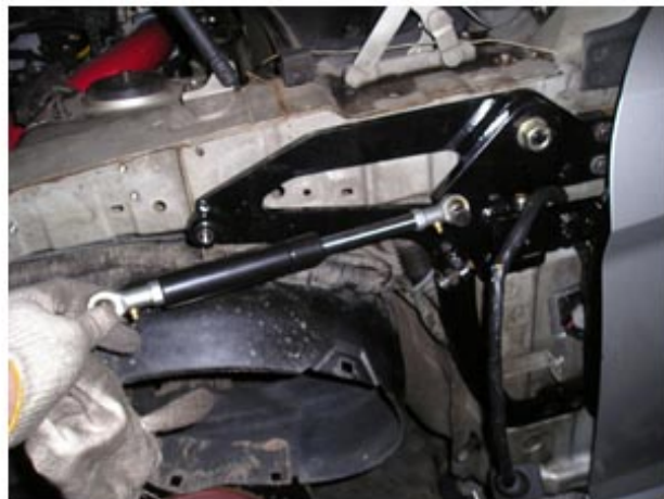
8. 쇼바장착시 쇼바의 방향을 주의깊게 살핀후 먼저 한쪽부분을 장착합니다. Orient the strut so that the body of the strut is towards the car and the rod is towards the door.