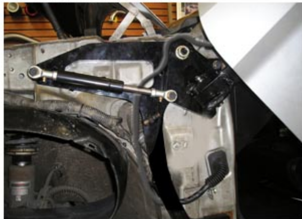
11. 배선의 간섭이 없도록 주의 장착하고, 장착이 잘 되어있는지 테스트 합니다. Open and close the door, and test the vertical action of the doors, moving the door and tightening the bolt.