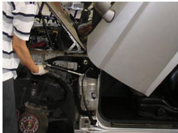
9. 문을 들어올린 후 쇼바의 나머지 부분을 장착합니다. Open the door. You will be able to open the door about 8 inches or so. When the door is completely open, raise the door completely. Use extreme caution at this stage as there is nothing holding the door up, so the heavy door must be supported 100% manually. Once the door is completely raised, attach the gas strut.