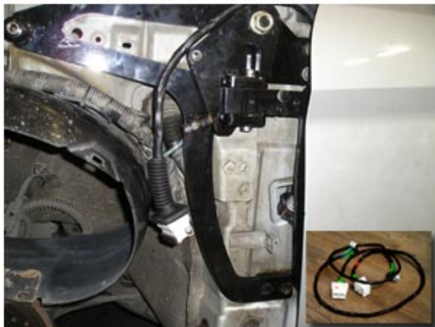
7. 하니스(벨매)를 조립하고 선의 위치를 그림과 같이 장착합니다.